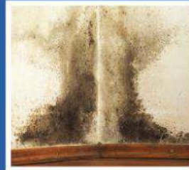
Toxic Black Mold Removal

Concerned about mold? Talk to the experts with over 10+ years of experience.