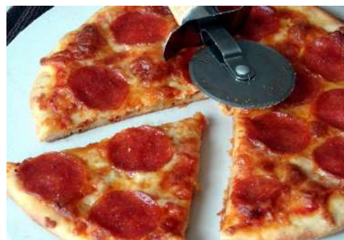
This Photo by Unknown Author is licensed